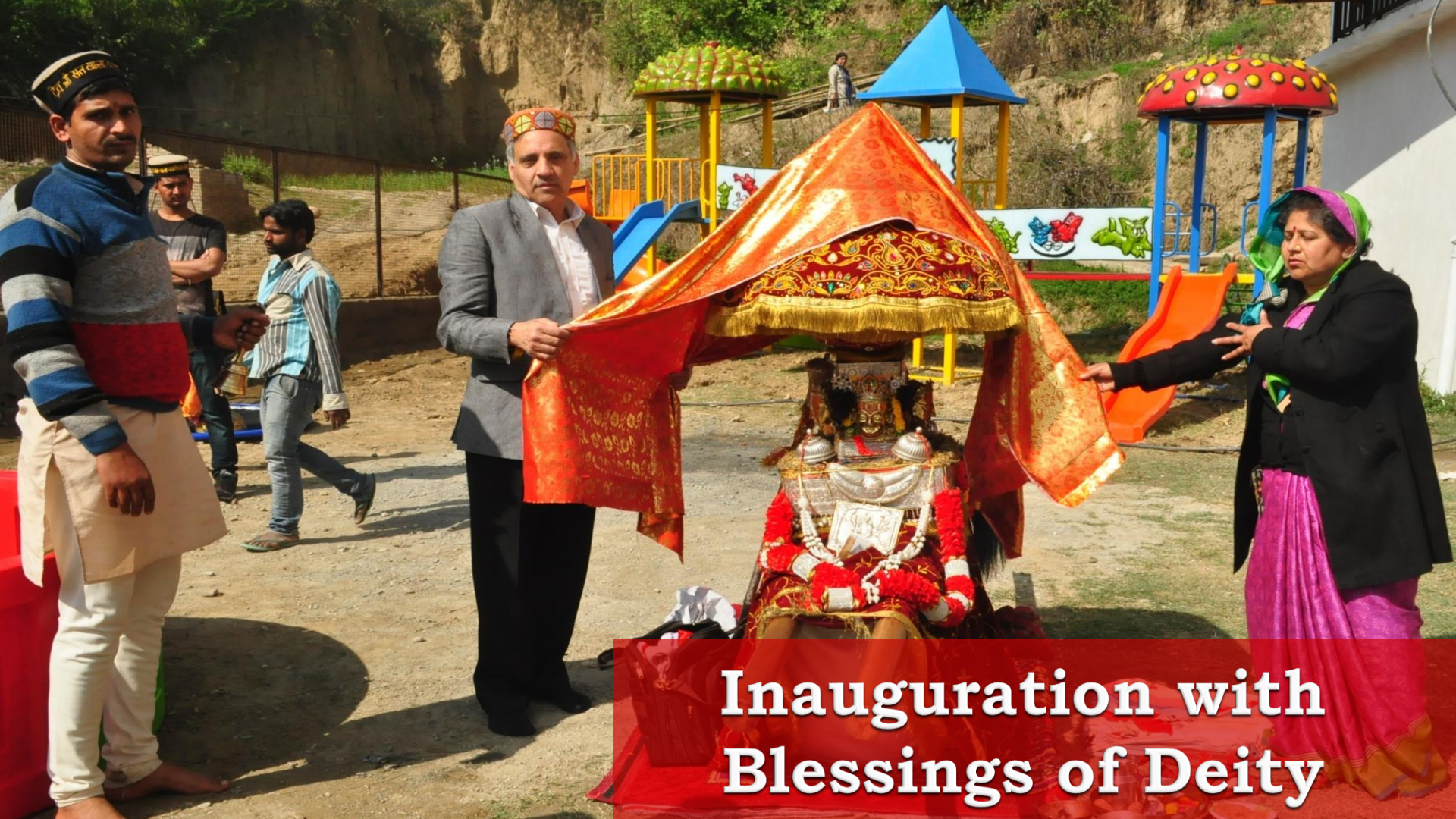
Inauguration with Blessings of Deity