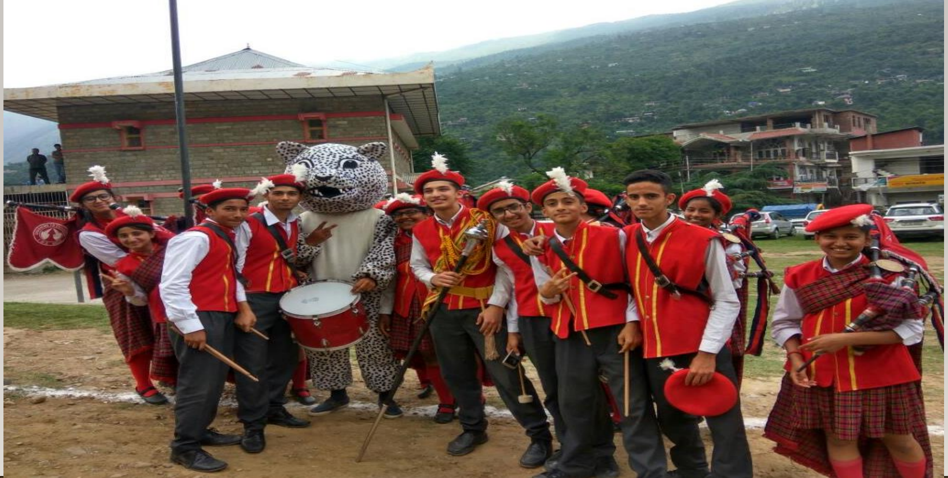
Students with the Olympic Mascot