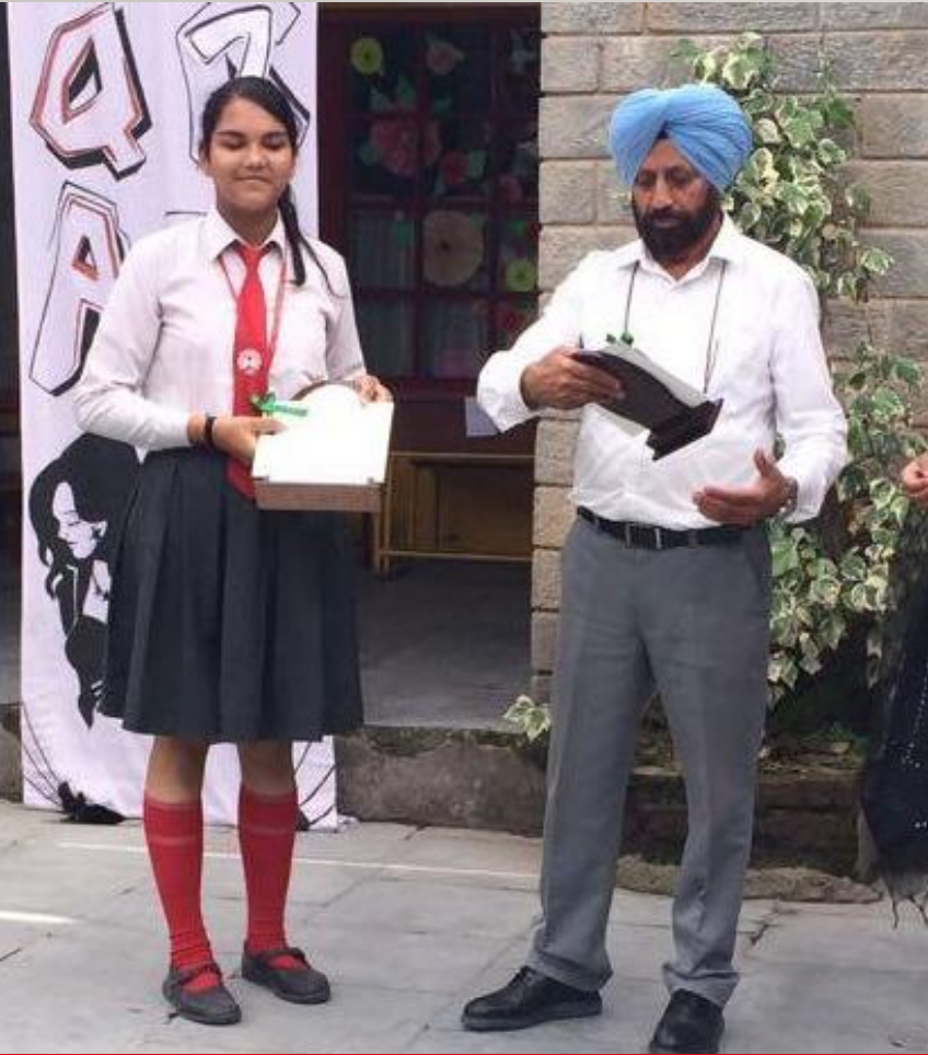
2 nd Eng. Declamation