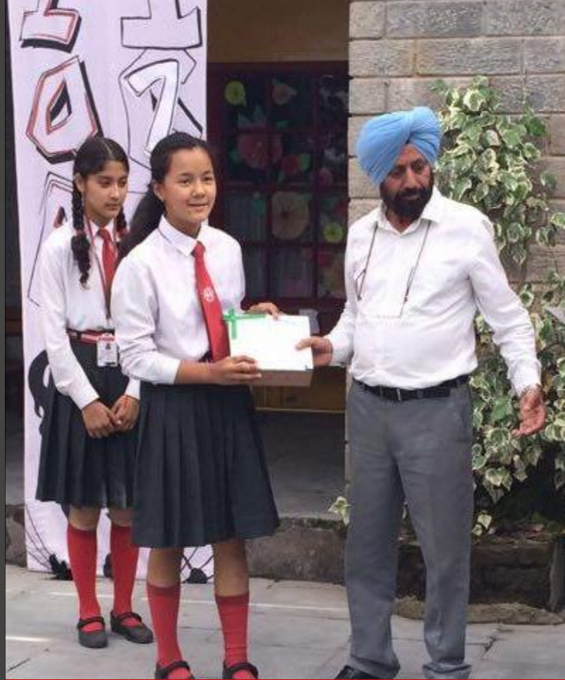
3 rd Spell Bee